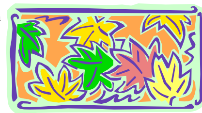
Autumn is in the air. Can you smell it?