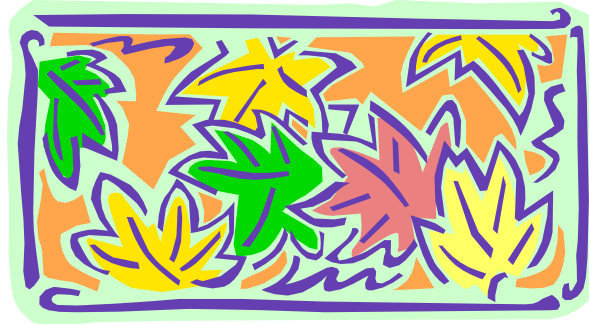
I feel fall in the air. Can you feel it?

They learn valuable skills such as sharing, teamwork, and cooperation. This is also a great time for caregivers to talk about the hardships and triumphs of loving these children and exchange tips and tricks.